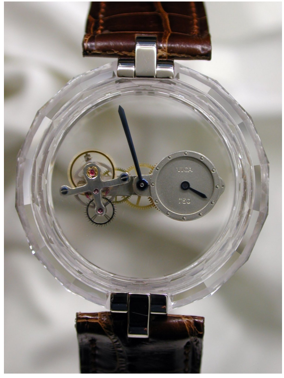
Vincent Calabrese movement with tourbillon