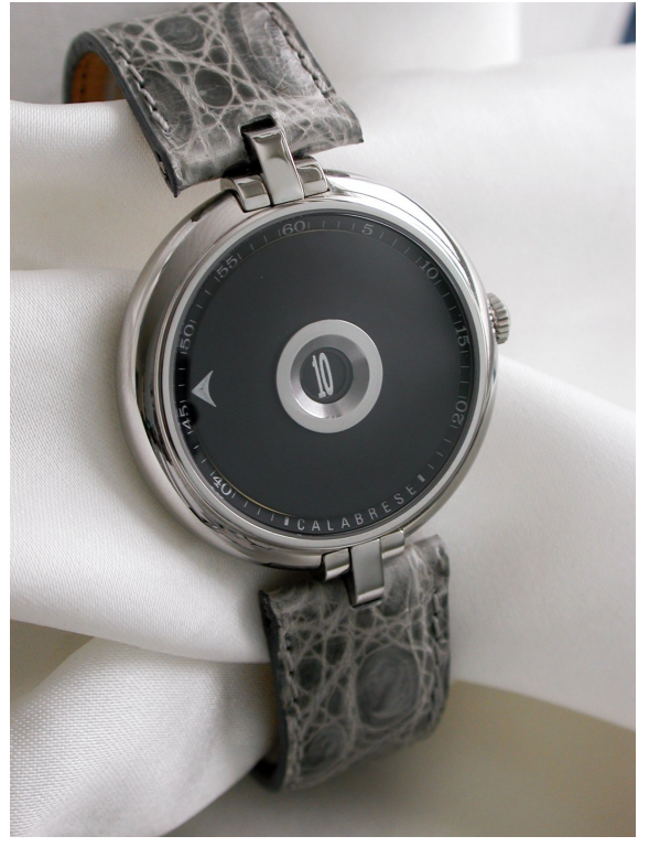
Vincent Calabrase Sun-Tral